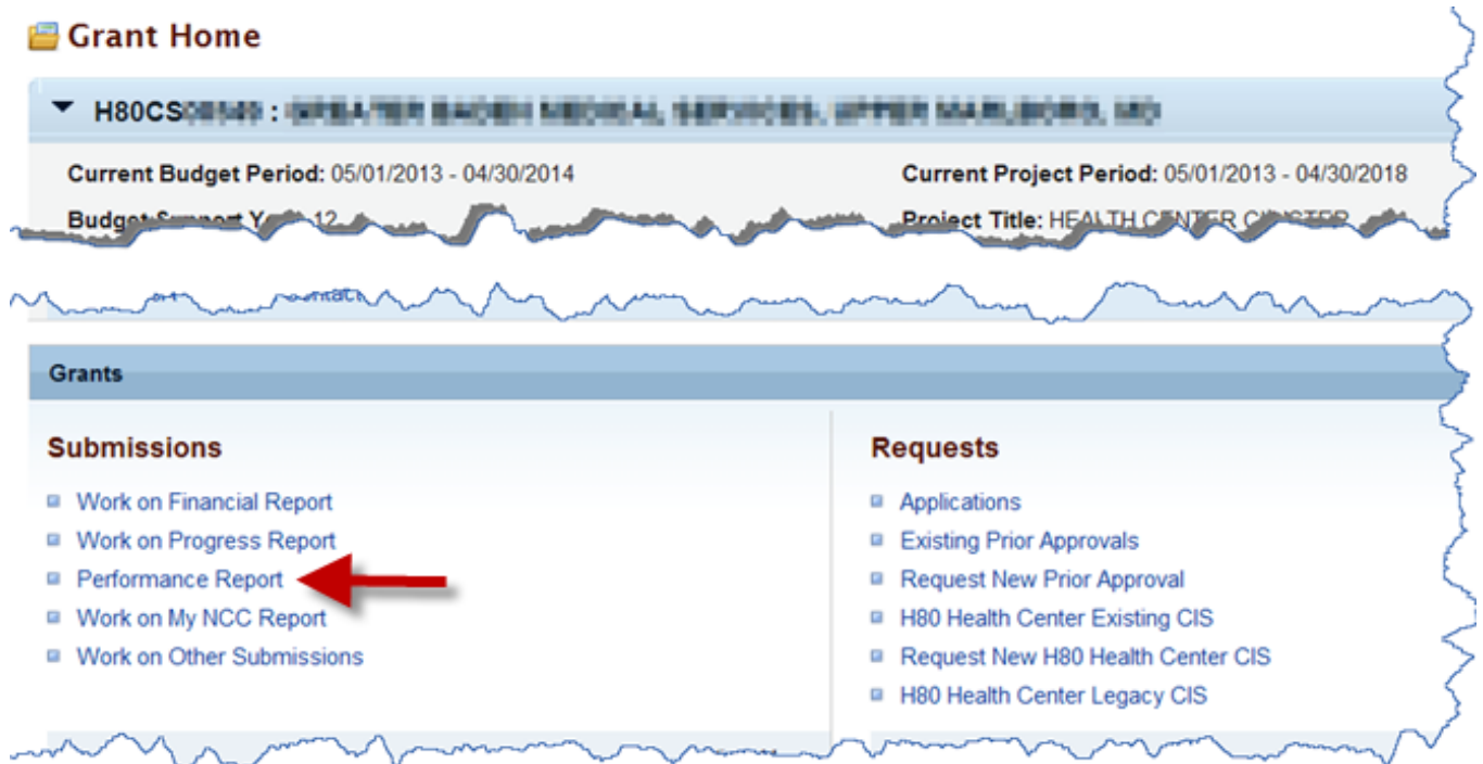
Figure 3: Grant Home Page